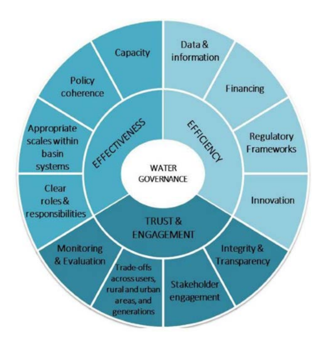
Figure 1.2. The OECD Water Governance Principles. Reproduced from OECD (2015).

stimulate a transparent, neutral, open, inclusive and forward-looking dialogue across stakeholders on what does and does not work, what should be improved and who can do what.